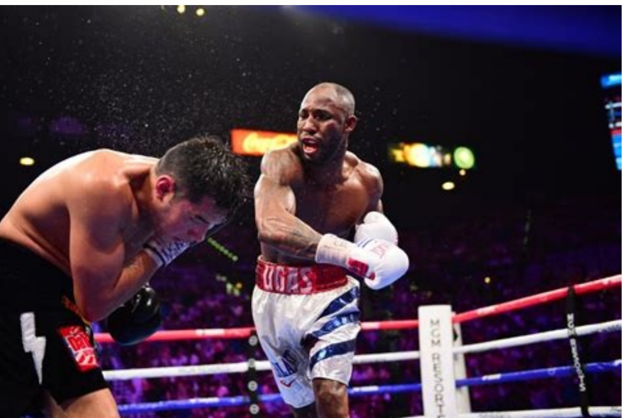
Manny pacquiao vs errol spence ppv buys. How many ppv buys for mayweather vs paul. How many ppv buys for mayweather vs pacquiao. Manny pacquiao vs errol spence ppv cost.