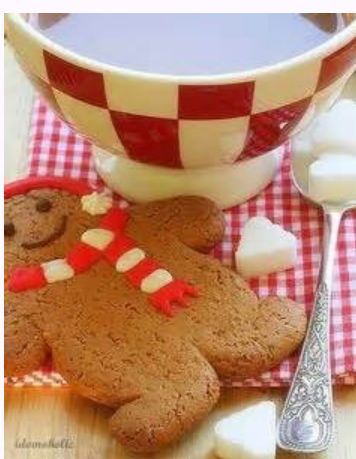
The gingerbread man jim aylesworth pdf.