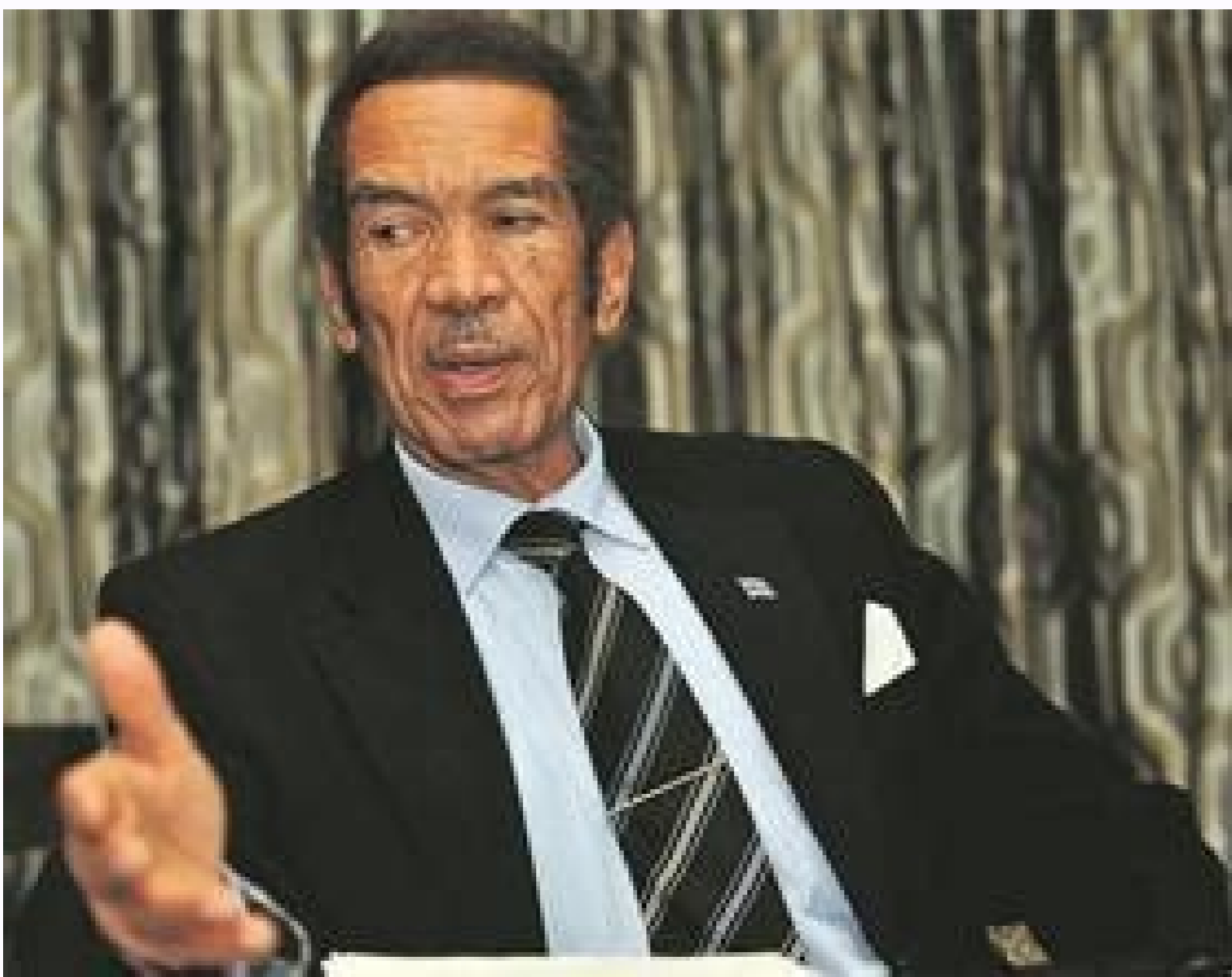
Former botswana president ian khama.